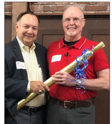
An umbrella for Dr. Steiner

Portugal gained its independence from the Moors in 1139. What followed was a succession of rulers, many of whom supported exploration of the new world. One notable Portuguese explorer was Vasco de Gama, who discovered the sea route to India, bringing much wealth to Portugal via the spice trade.