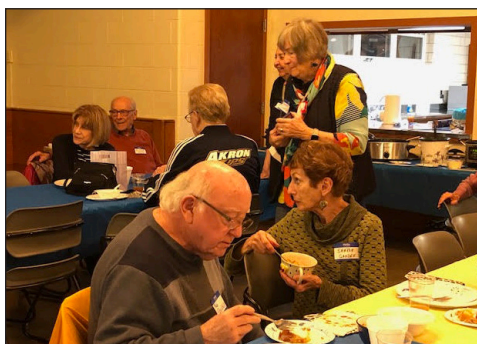
Dining and socializing